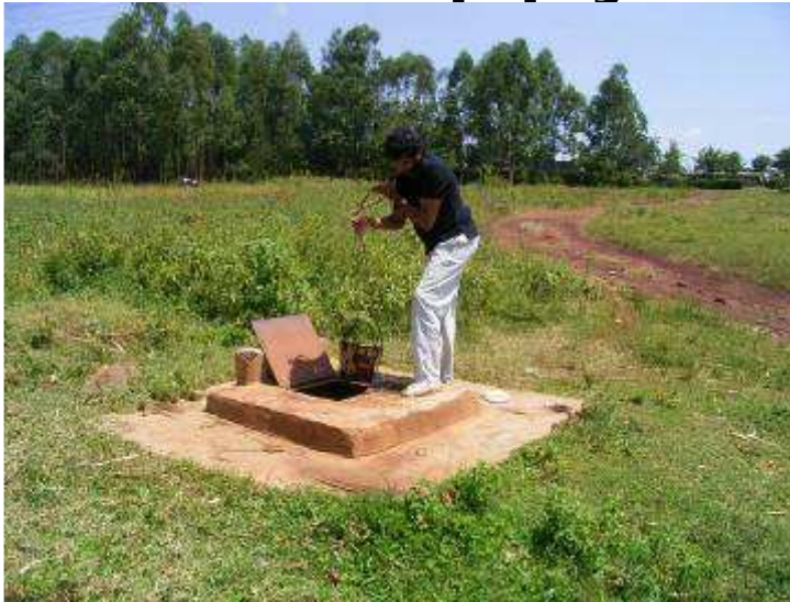
The temporary water well. In future, we'll fix the water tank under the building