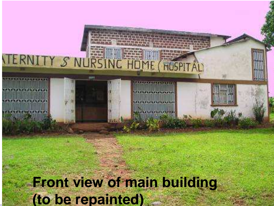
Front view of main building (to be repainted)

Here are some pictures and a map of the buildings of Happy Home. We have two buildings, one large front building (top picture) that needs the roof changed and will therefore not be used at start. The smaller back building is in better condition and big enough to host 15 children.