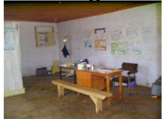
Future dining room