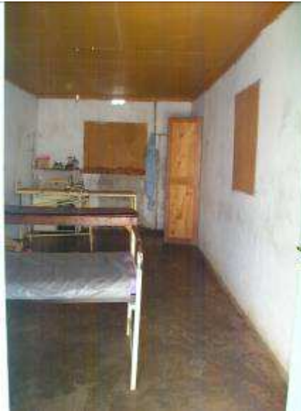
Girls dorm (wooden panels to be changed into windows)