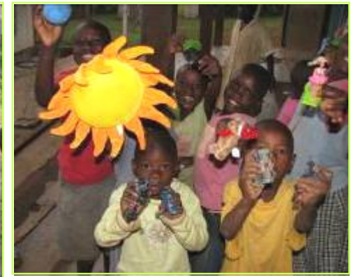
All proud to show what they have