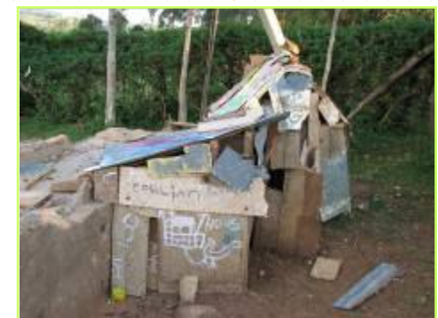
The boys' house