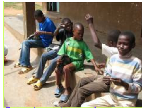
Boys enjoy sewing as well