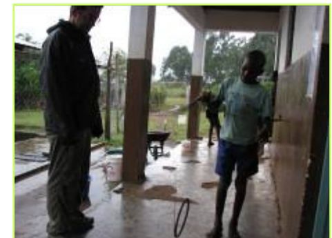
Playing with a ring and rope