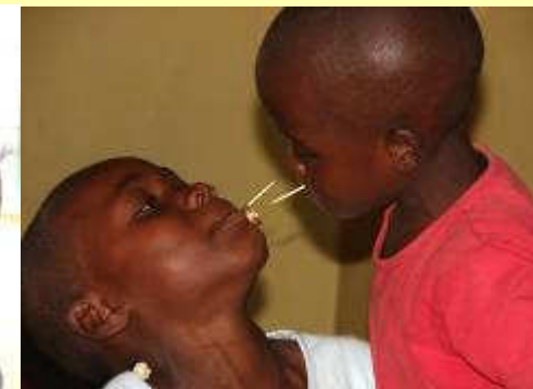
The tricky game of passing on the ring from mouth to mouth using a toothpick