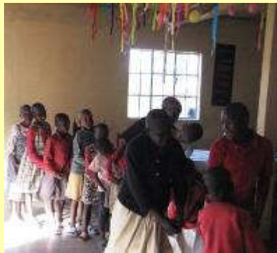
Songs and dances: a wonderful presentation created by the kids.