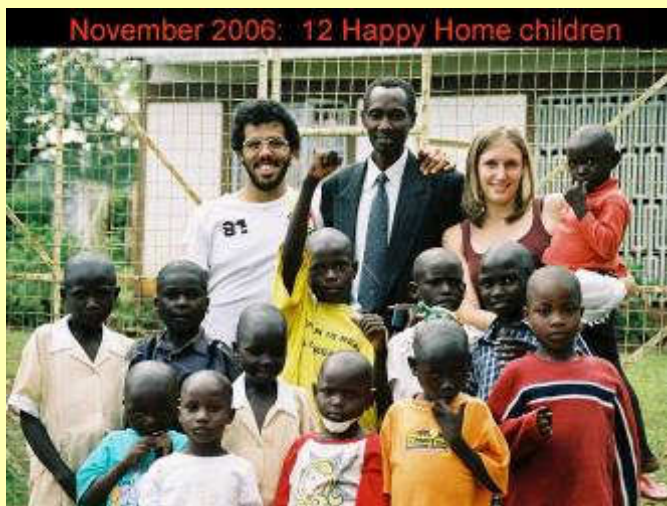
November 2006: 12 Happy Home children