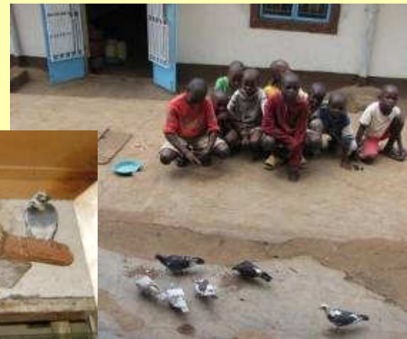
The boys and the doves