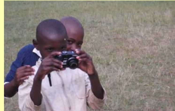
High tech kids in Happy Home

Our aim is to help orphans and vulnerable children by providing them a nurturing family atmosphere in which to grow. Each child receives access to safe shelter, good nutrition, basic health services and education. We believe it is important for the children to grow up in their own culture within their own community and to maintain contact with their extended families. To that end, we recruit staff from the area, send the children to a local school and encourage them to go on family day visits during school holidays.